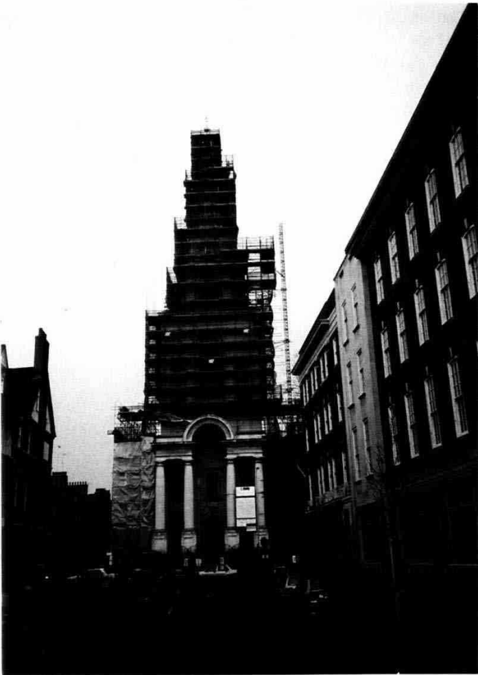
The 200ft high scaffolding giving access for stone repairs and structural works