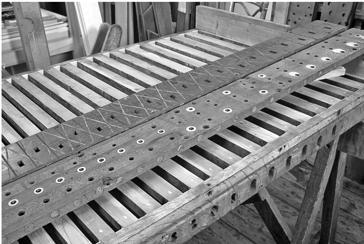
The soundboards, large wooden chests that support the organ pipes.

For details of this and for other specific items to fund please contact the Friends' office.