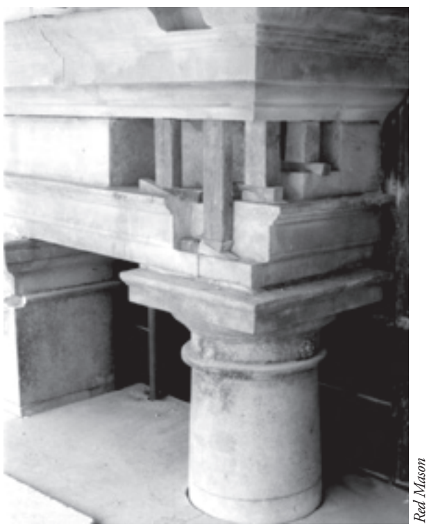
Repairs in progress to the entablature on the south side of the east window.

Hugo Glendinning's photograph shows how fine the crypt is; and we hope to have it open to the public soon.