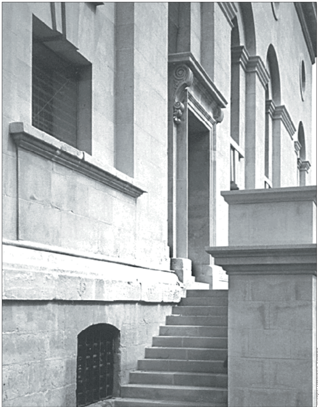
The South Steps complete: May 1999

Please support us by subscribing or making a donation. Use the coupon in this issue to make a donation, or telephone the Friends' office on 0171–247 0165.