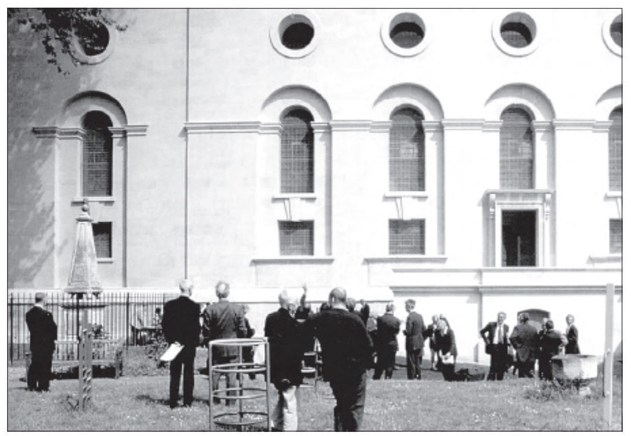
Guests at the opening admire the Steps and cleaned south façade

The programming of the work ensures that