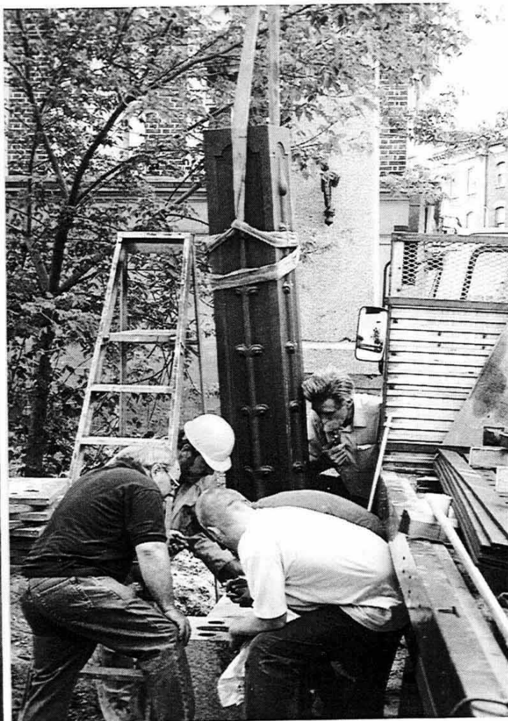
A gate pier being lowered into place. ↑